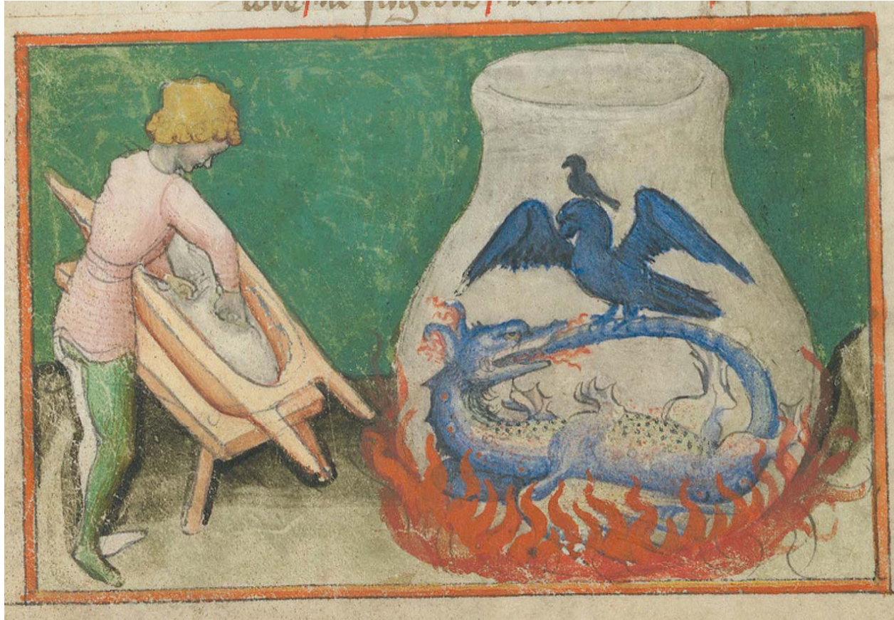
Depiction of an Ouroboros from the alchemical treatise Aurora consurgens (15th century), Zentralbibliothek Zürich , Switzerland